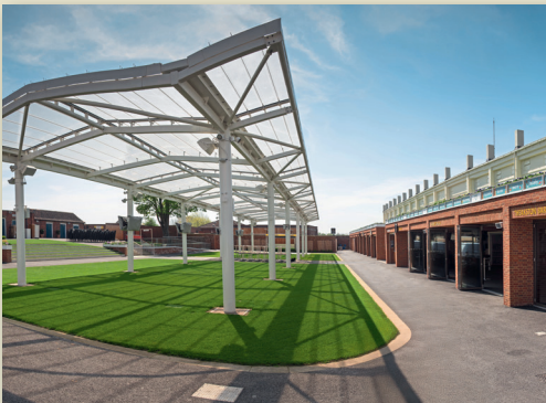
York Design Awards Bustardthorpe Development Sustainability Award winner 2025