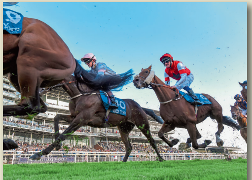
Top Ranked ROA Racecourse Accreditation Award and ROA Gold Standard 2025