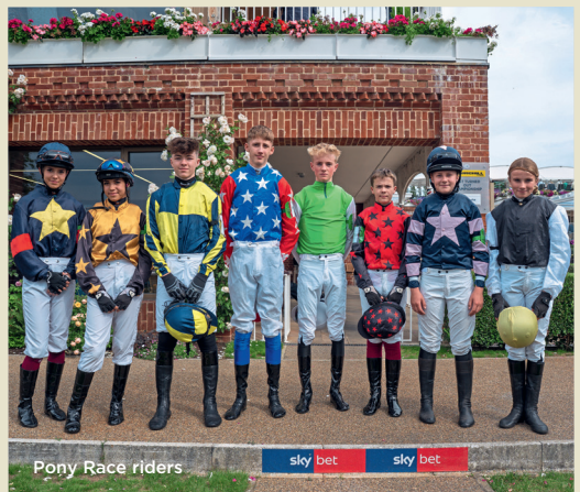
Pony Race riders