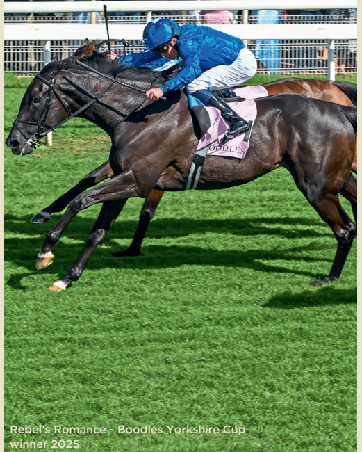
Rebel's Romance - Boodles Yorkshire Cup winner 2025