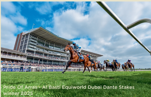
Pride Of Arras - Al Basti Equiworld Dubai Dante Stakes winner 2025