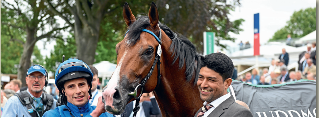
Top rated racecourse in Britain for Stable Staff - National Association of Racing Staff 2025