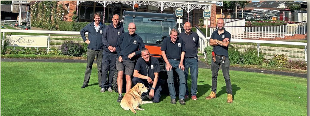
York - Winners of the Grounds Management Association Professional Horseracing Grounds Team of the Year 2025