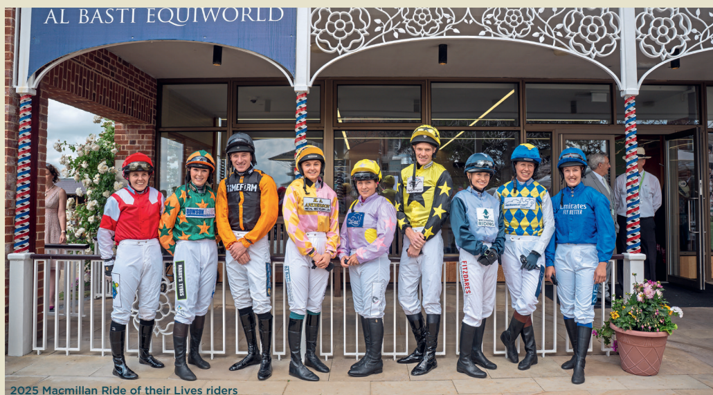
2025 Macmillan Ride of their Lives riders