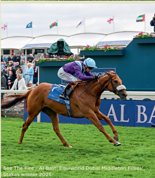
See The Fire - Al Basti Equiworld Dubai Middleton Fillies' Stakes winner 2025