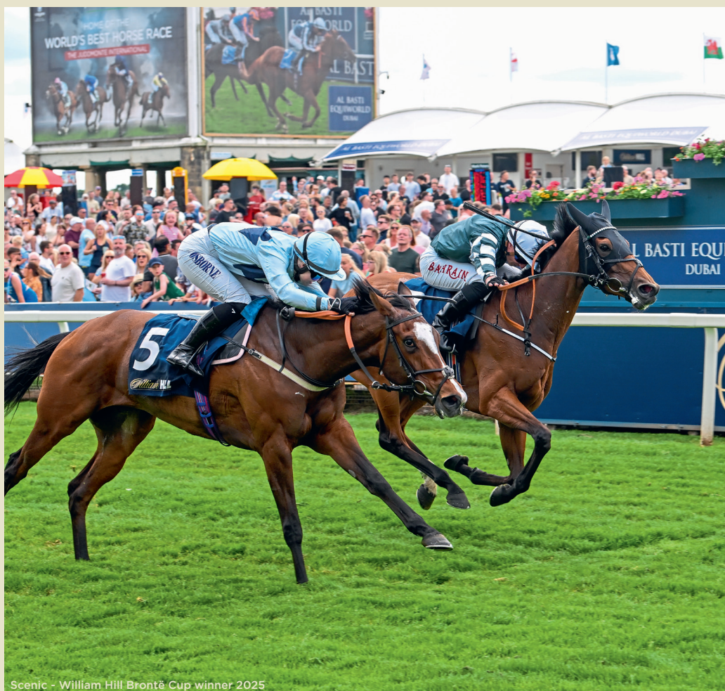
Scenic - William Hill Brontë Cup winner 2025